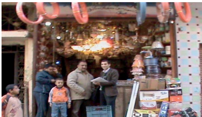
distributors in Sahil Seleem

In total 108 distributors' shops have been surveyed (86 in Dakahlia and 22 in Assuit). The selected shops cover the full range of equipment home appliances, air conditioning equipment, and electricity and lighting components in the surveyed cities, towns and villages.