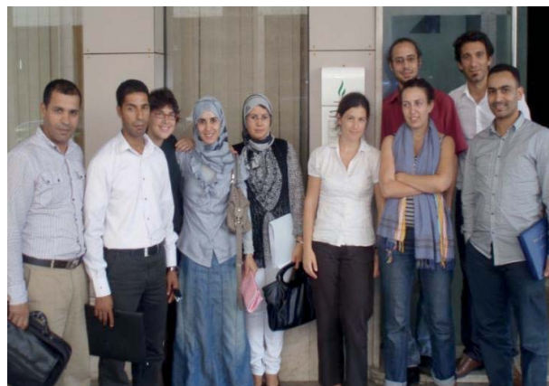
© PlaNet Finance: Training for Trainers, Rabat Sept 2011

Marion ALLET , PlaNet Finance mallet@planetfinance.org