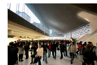
“Bocconi & Jobs”

Presentations are available at: www.planetfinancegroup.org/pdf